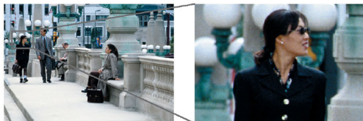
30X optical zoom